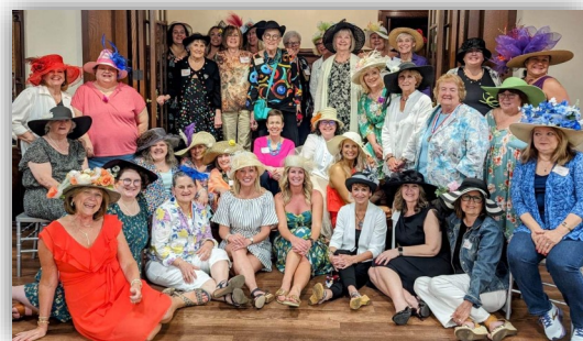
WCH Annual Meeting/Derby Style, May 2023